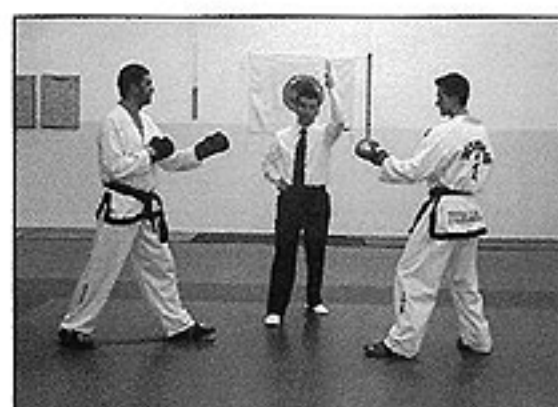
f. One finger up to indicate the first round "IL HUE JONG"