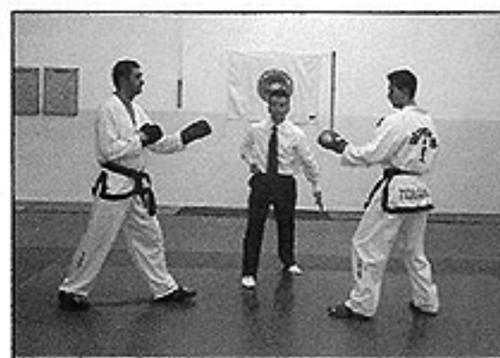
g. Move arm downwards and leg backwards – "SHI-JAK"