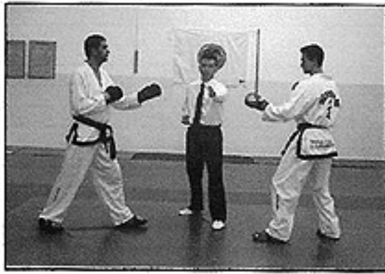
i. Ready "JUNBI"