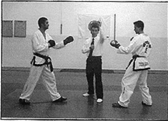
j. Continue "GAESOK" moving hand upwards