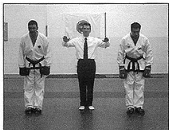
b. Competitors bow to the Jury table "KYONG-YE"