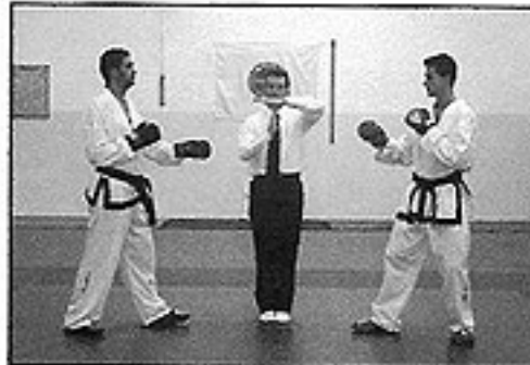
l. Time stop "JUNG-JI"