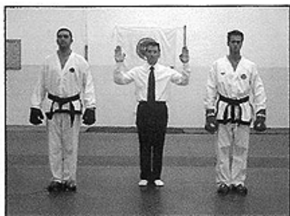
a. Competitors enter the ring "CHARYOT"