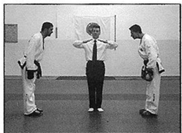
d. Competitors bow to each other "KYONG-YE"