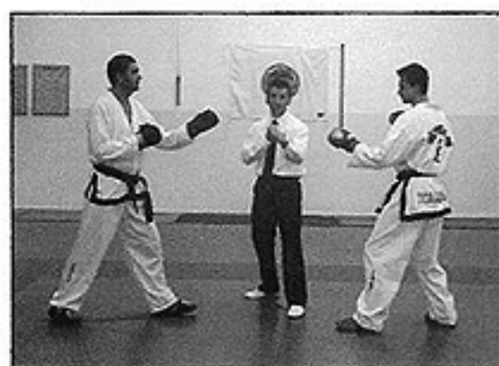
e. Ready "JUNBI"