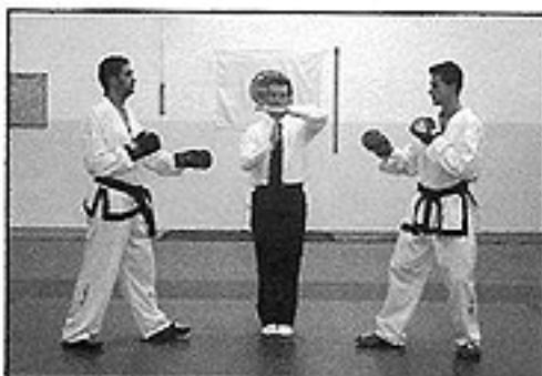
l. Time stop "JUNG-JI"