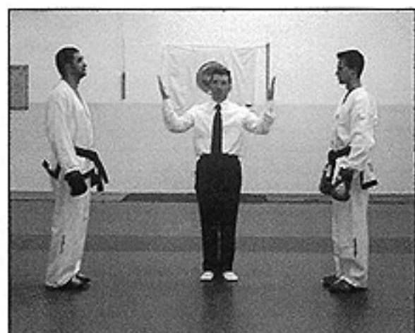
c. Competitors face each other "CHARYOT"