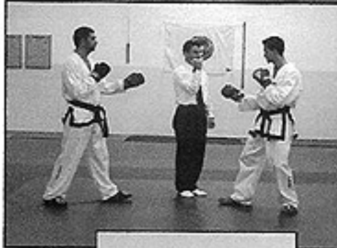
m. Do not speak