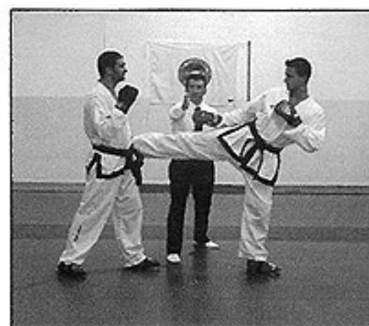
h. Stop during the bout: "HAECHYO"